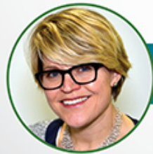
ANDREA ZEIGLER President, Workopolis

Friday, April 28, 2017 8:00 AM - 10:00 AM Holiday Inn Express 1325 Seymour Street, North Bay