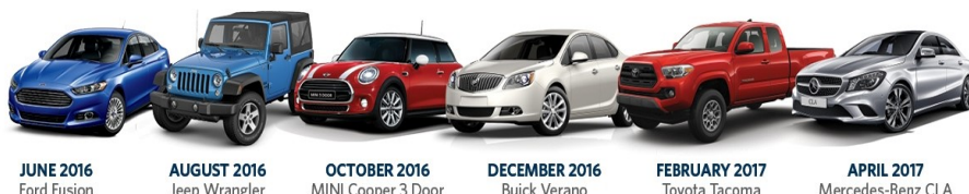
JUNE 2016 Ford Fusion