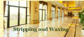
Stripping and Waxing

Our commercial cleaning services can be tailored to businesses of any size and type. You can count on us to give you the level of attention your business needs to make sure everything looks sparkling new. Our cleaning solutions make owners and operators feel proud of the business they work for.