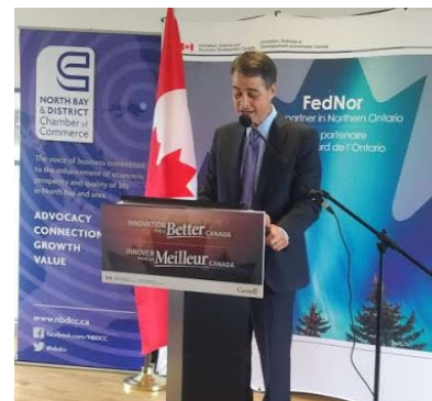
Above: MP for Nipissing-Timiskaming Anthony Rota introduces his colleague Minister Navdeep Bains at Discovery North Bay during a media announcement

Minister Bains stated "Each region of our country has unique strengths. That means innovation doesn't just happen in the big cities—it happens in every region of the country. Where innovation happens matters because that's where the best jobs are located. Our government's goal is to promote regional advantages that help our homegrown companies develop into globally competitive successes."