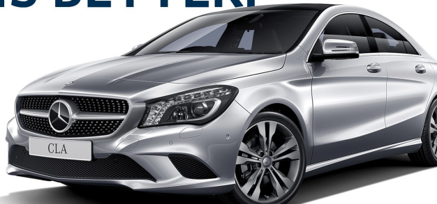
Mercedes-Benz CLA draw date is April 7, 2017. Prizes may not be exactly as shown.