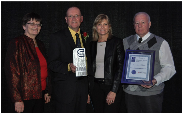
Innovation Award went to Metso Minerals Canada Ltd. The award was presented by Canadore College.