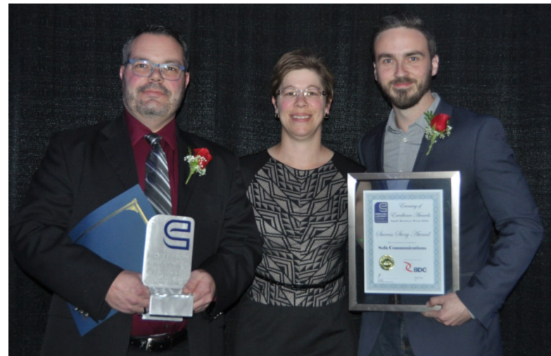
Success Story of the Year went to Sofa Communications with BDC presenting the award.